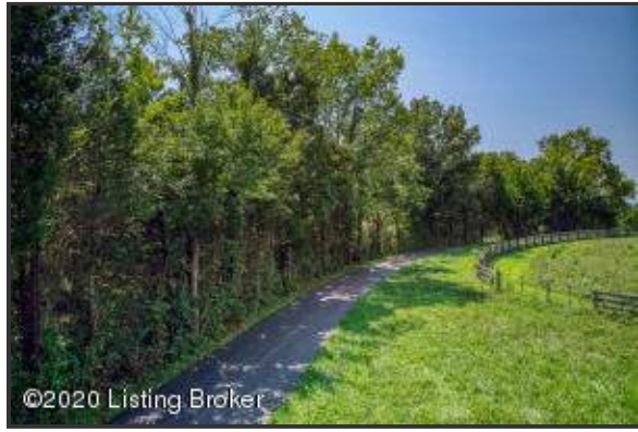
Quiet Secluded Lane