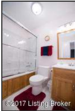
The hallway full bath offers a neutral color palette, white tile and sliding glass doors enclosing the shower area