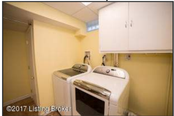
Large Laundry Room space is equipped with washer and dryer hook ups, utility sink and shelving for hanging items and storage