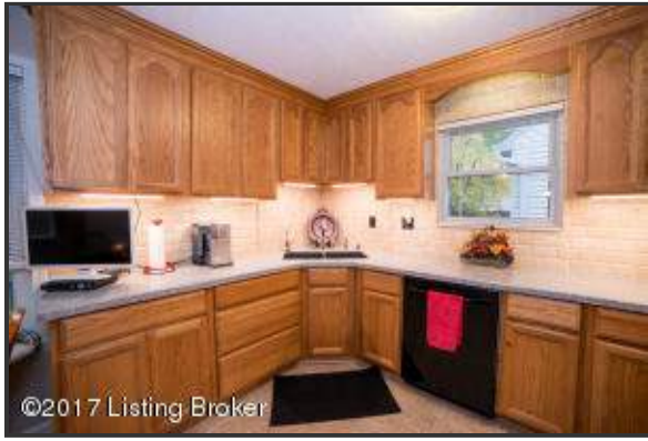
Neutral Corian countertops and natural stone, subway tile backsplash provide plenty of counter space, perfect for someone who loves to cook!