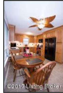
Kitchen is open to the dining space – perfect for entertaining guests!