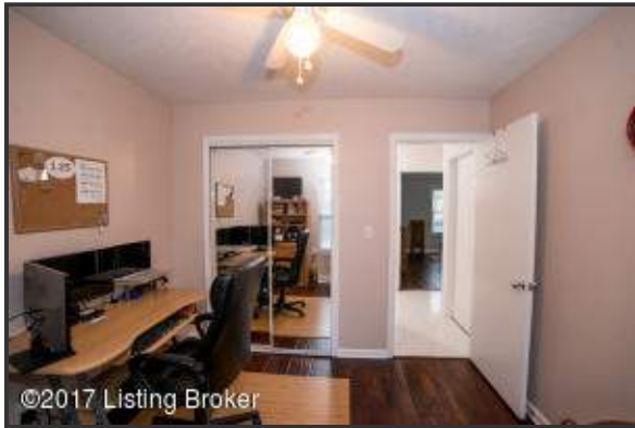
The first bedroom features a window, mirrored, sliding door closet, rich hardwood flooring and an overhead light fixture