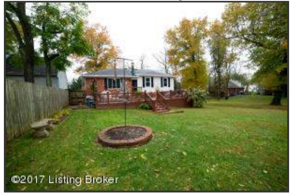
The recently updated back deck features skirting for underneath storage, as well as built-in outdoor lighting and a wide stairway leading to the backyard