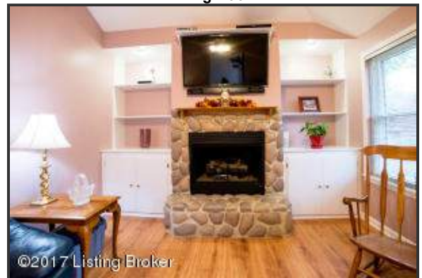
The fireplace is the focal point of the space; featuring natural river rock, framed by custom built-ins and highlighted by recessed lighting – gas logs and vent free!