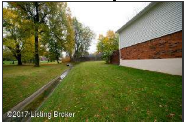
Home is surrounded by an enormous front and rear yard for expansive greenspace and unlimited outdoor living