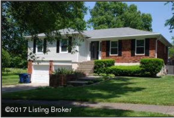
This charming home features a brick exterior with neutral siding, highlighted by black shutters and coordinating front door