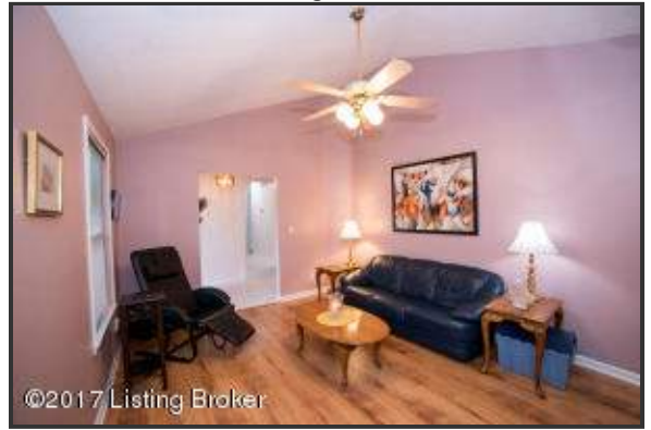
Living room is accessible from the Foyer