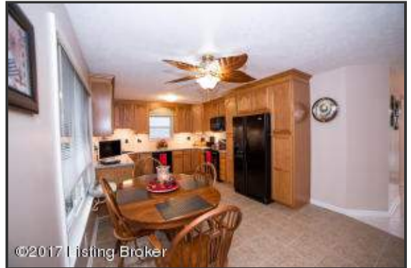
The Kitchen features custom oak cabinetry, Corian countertops and black appliances to remain – note the new microwave