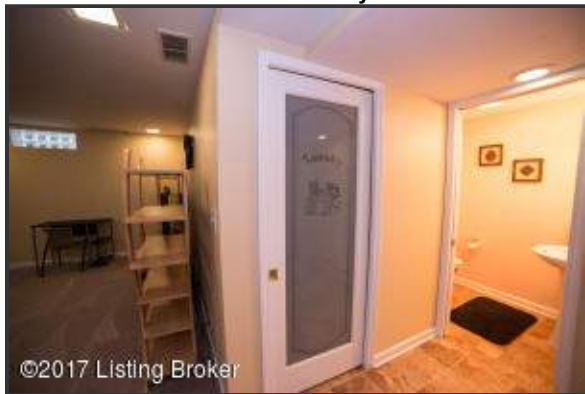
Lower level offers accessibility to the Laundry room and additional half bath