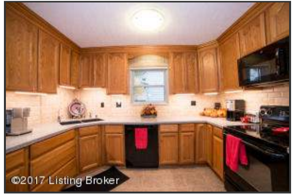
Kitchen is well lit from updated light fixtures, and is equipped with under cabinet LED lighting for additional illumination