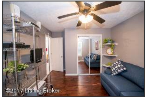
The second bedroom features a window, mirrored, sliding door closet, dark hardwood flooring and corner shelving for storage or display