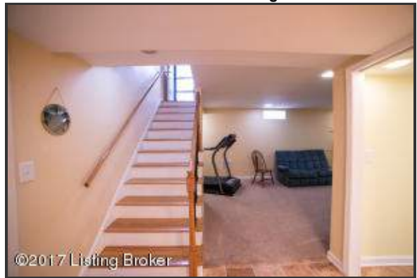
Hardwood steps and natural wood railing lead to the lower level living area