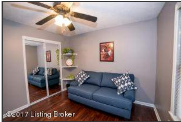
The second bedroom features a window, mirrored, sliding door closet, dark hardwood flooring and corner shelving for storage or display