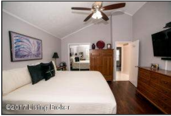
The Master Suite is serviced with mirrored, sliding door closet