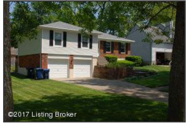
Home is meticulously maintained with updates throughout, including roof, AC, windows and vinyl siding