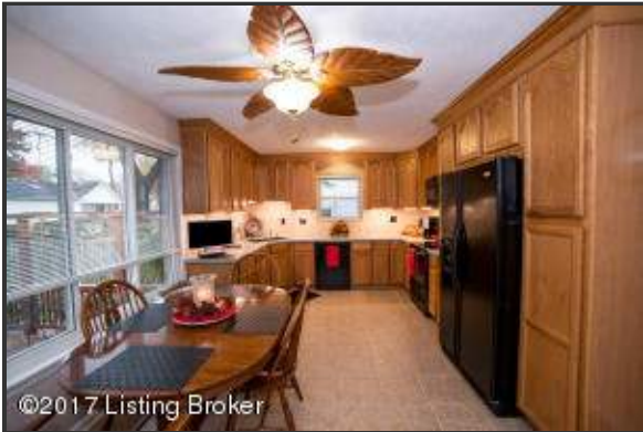
The efficient U-shaped layout of the Kitchen is an appropriate use of space for such a large area