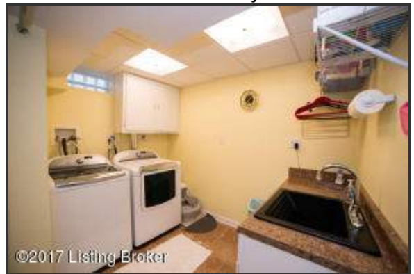
Large Laundry Room space is equipped with washer and dryer hook ups, utility sink and shelving for hanging items and storage