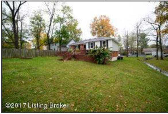
Step from the Kitchen to the spacious back deck (16x40); can easily accommodate your outdoor furniture and grill!