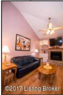
White trim and baseboards throughout give the home a crisp, clean look