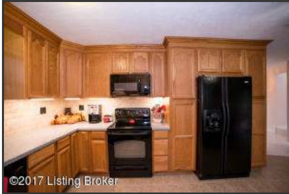
Kitchen is serviced by two large pantries framing the refrigerator – outfitted with pull-out shelves for convenient accessibility