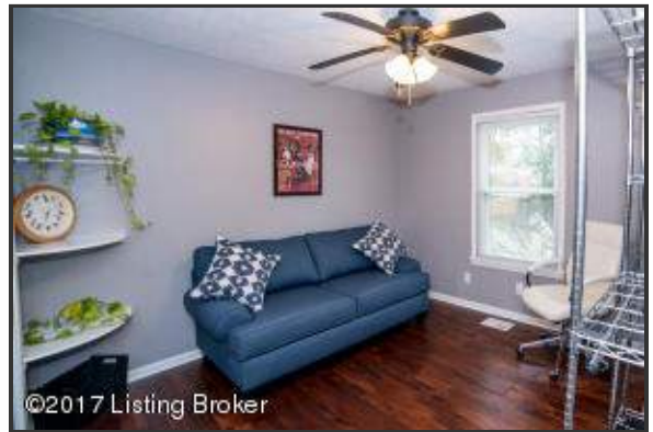
The second bedroom features a window, mirrored, sliding door closet, dark hardwood flooring and corner shelving for storage or display