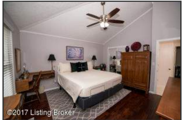
The Master Suite is truly stunning; Dark hardwood flooring and tall vaulted ceilings compliment the space