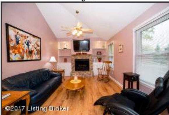
Hardwood floors, vaulted ceiling and oversized windows - the perfect canvas for your new home!