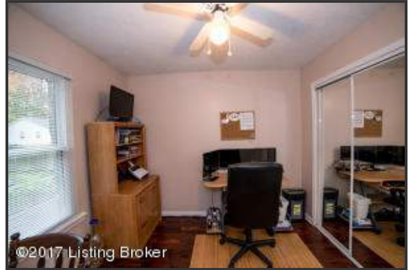
The first bedroom features a window, mirrored, sliding door closet, rich hardwood flooring and an overhead light fixture