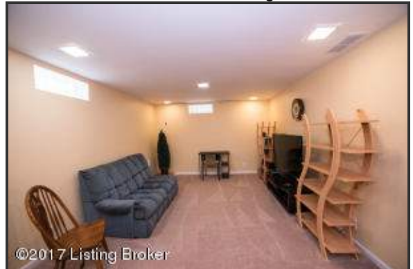
Large living room boasts transom windows to keep the space well lit, as well as updated recessed lighting