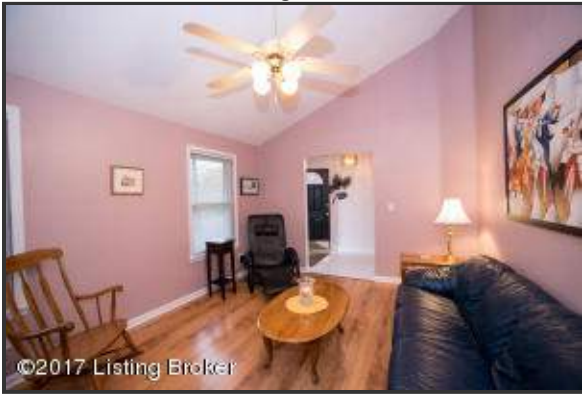
Two, oversized windows with white trim provide plenty of natural light