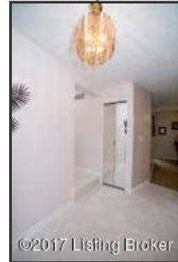
The Foyer is serviced by a convenient coat closet, dressed in mirrored doors