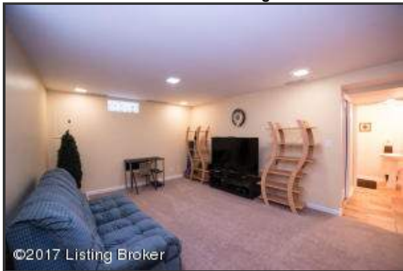
Large living room boasts transom windows to keep the space well lit, as well as updated recessed lighting