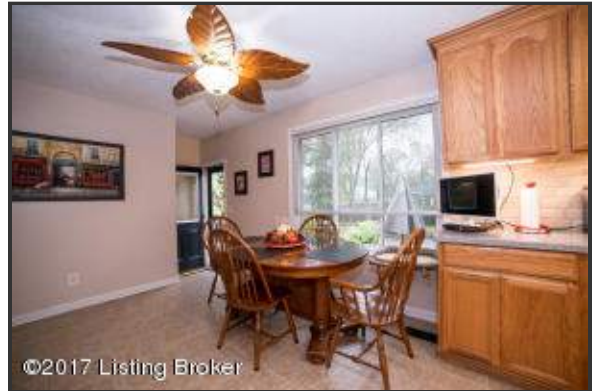
The eat-in Kitchen hosts a large triple window overlooking the backyard