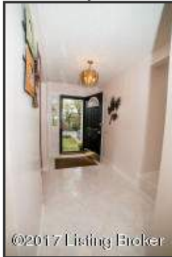
As you enter the home note the sophisticated black door accented with sunburst window and framed by sidelights