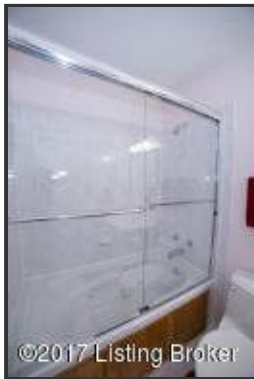
Oak vanity and bathtub frame give the bath a cohesive look