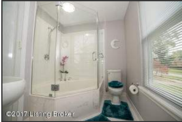
En Suite full bath hosts an oversized, Whirlpool garden tub with glass doors for an enclosed shower area