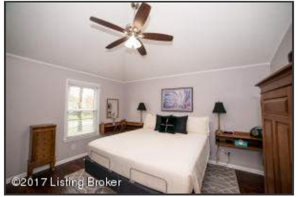
Bedroom is detailed with crisp, white trim, crown molding and baseboards – and finished with dark hardwood flooring