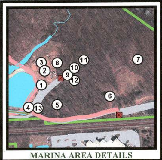
MARINA AREA DETAILS