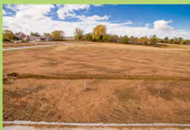
LOT 20 12,271SQFT