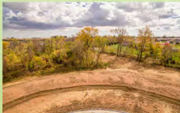
LOT 6 30,033SQFT