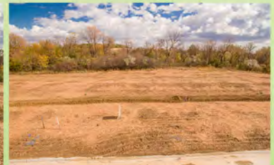
LOT 12 12,474SQFT