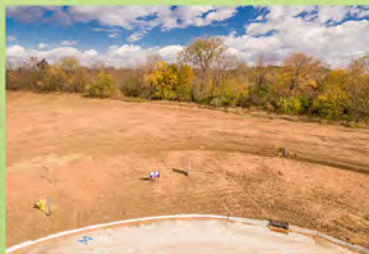
LOT 14 21,484SQFT