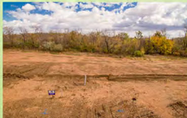
LOT 9 12,603SQFT