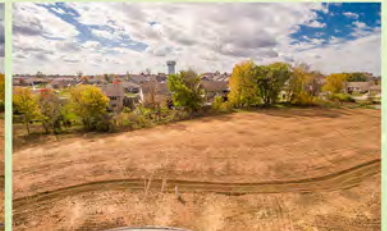
LOT 5 14,809SQFT