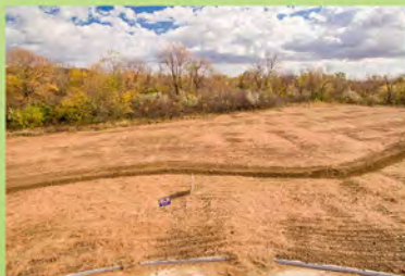
LOT 13 11,730SQFT