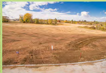
LOT 18 11,965SQFT