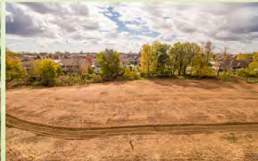
LOT 4 12,786SQFT