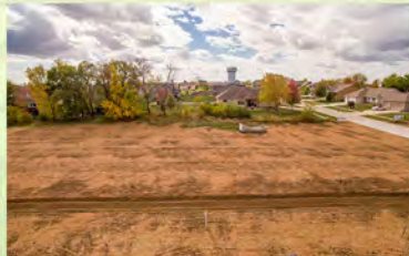
LOT 2 12,468SQFT