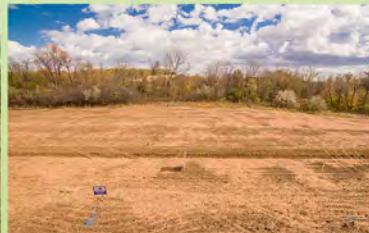
LOT 11 12,625SQFT