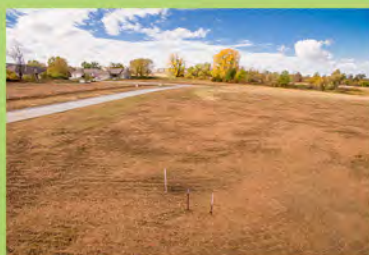
LOT 21 12,738SQFT