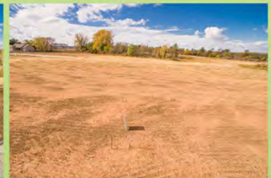
LOT 19 12,122SQFT