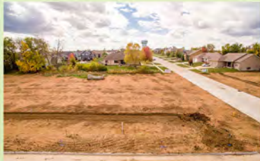
LOT 1 14,825SQFT